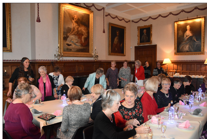
Members enjoy tea in the Dining Room at Lydney Park