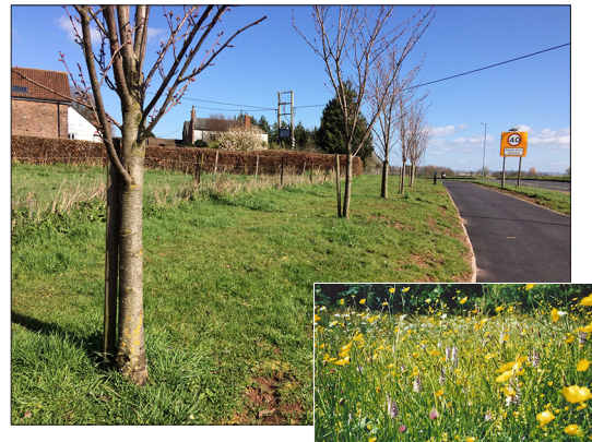
Dean Meadows Group

Regular mowing all around the edge of the trial wildflower verge will continue from April to October, including the narrow strip which runs alongside the road. The rest of the verge will be allowed to grow until July when it will get its first cut. It is hoped the number and variety of wildflowers on this verge will increase over time.