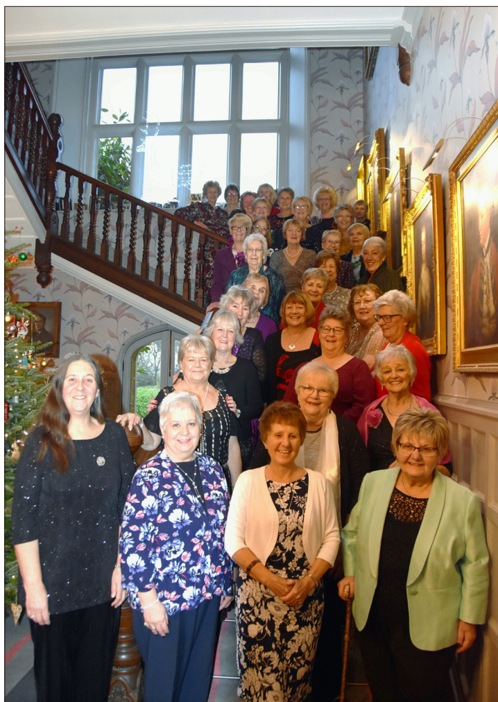
Members at Lydney Park