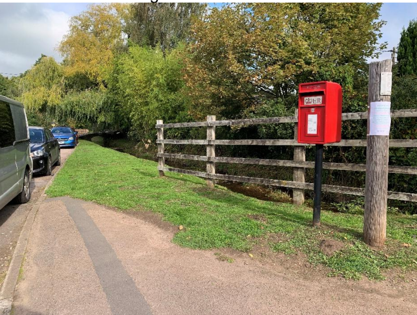
Mill Brook Green verge