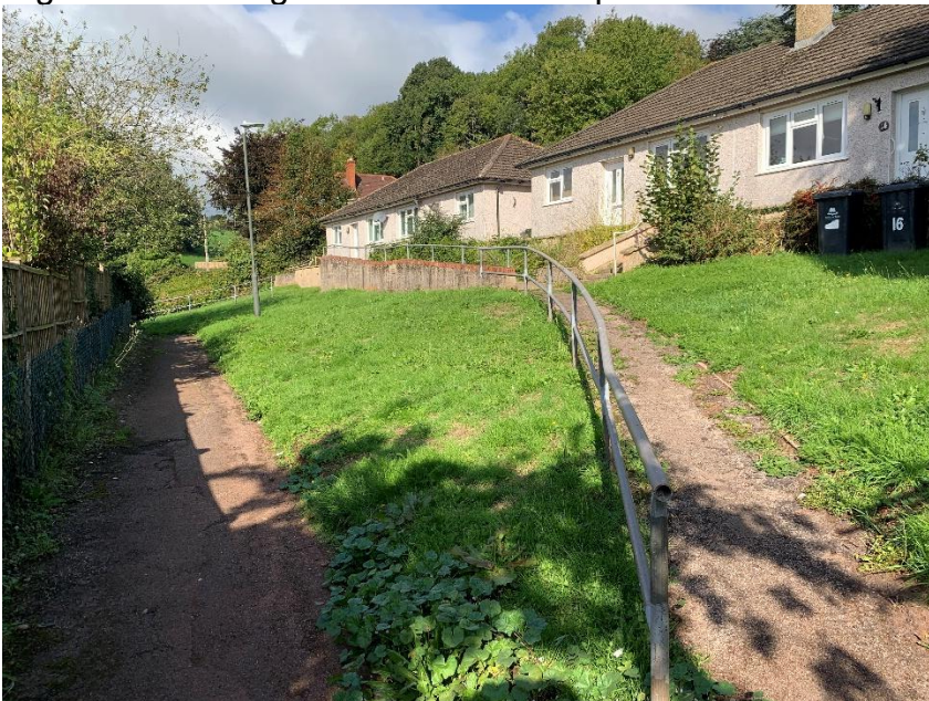
Milling Crescent – near bungalows