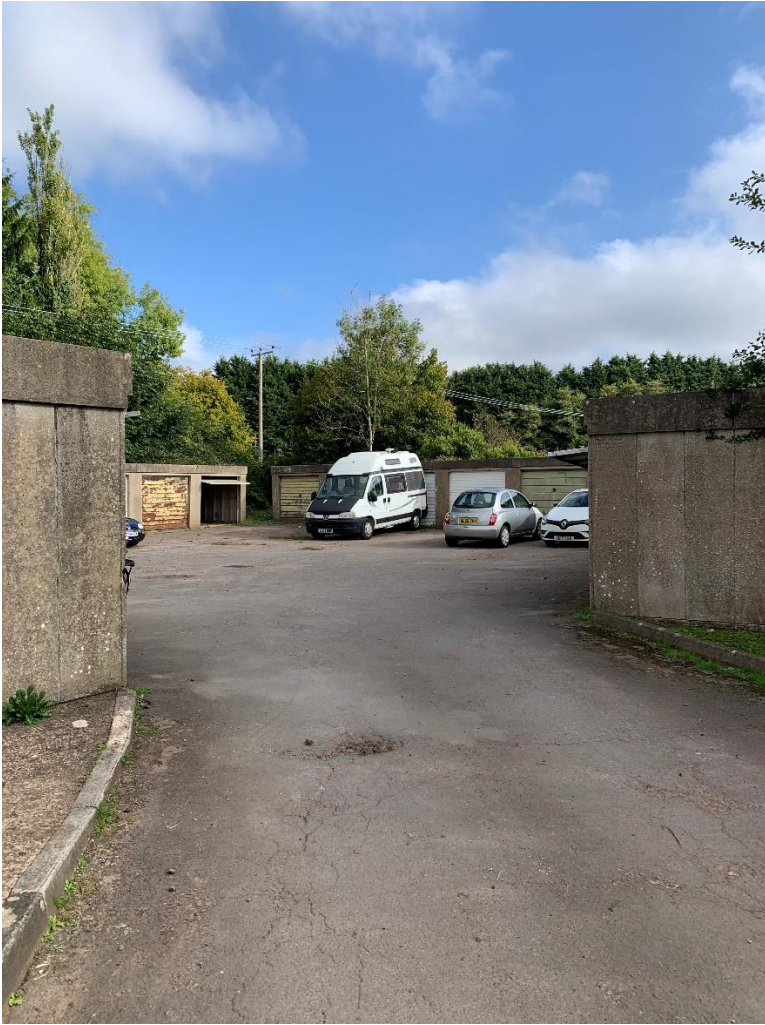
Mill Brook Green - garages