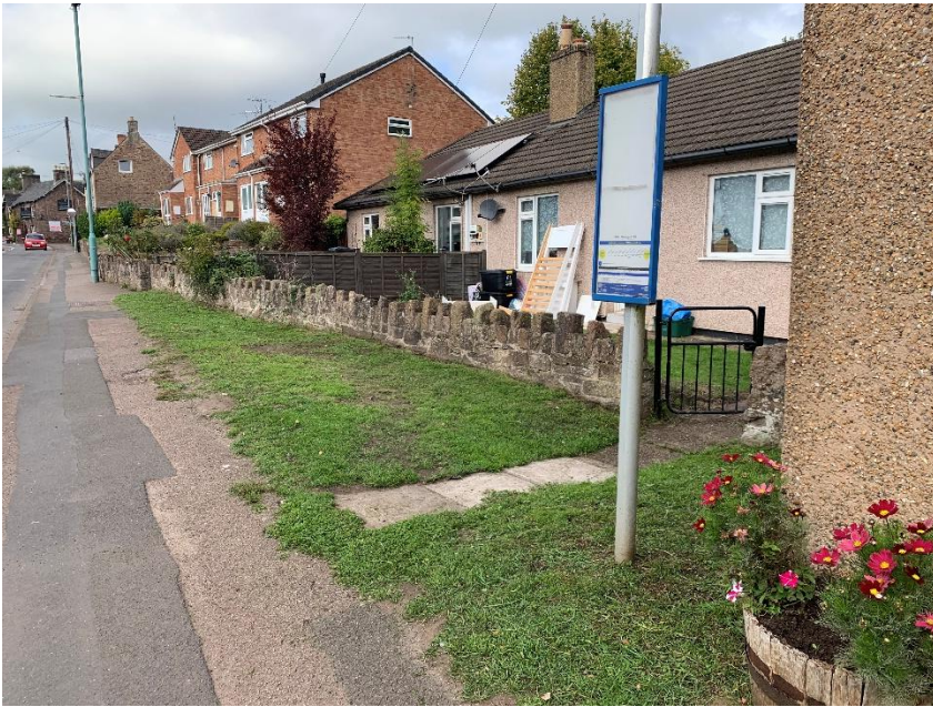
High Street/Milling Crescent – bus stop