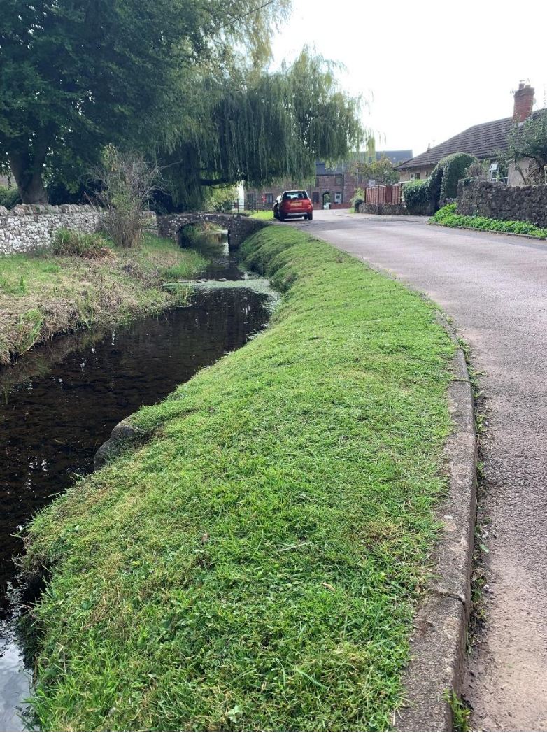
Mill Brook Green verge