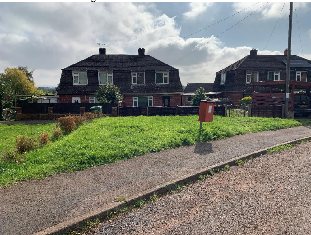
Milling Crescent verge