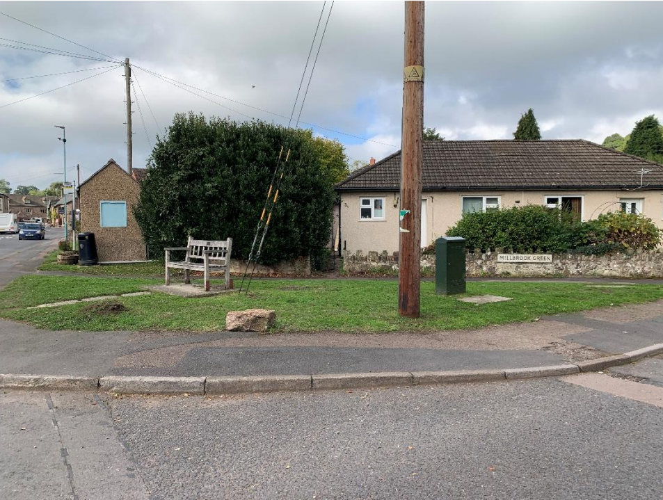
Mill Brook Green verge