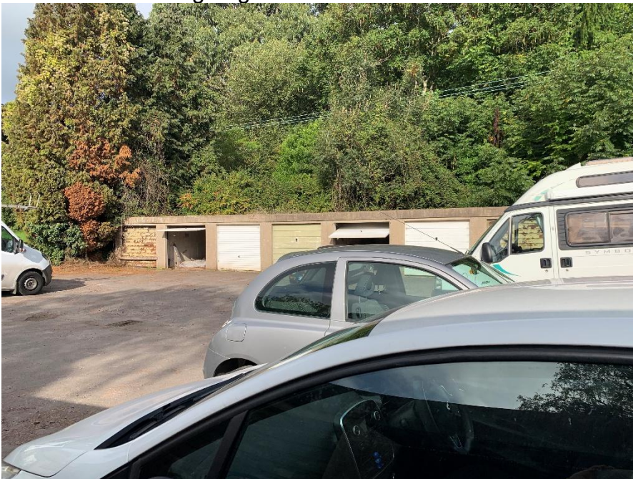
Mill Brook Green - garages