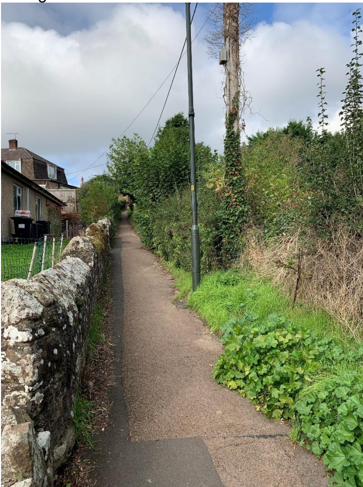
Milling Crescent – Church Rd footpath