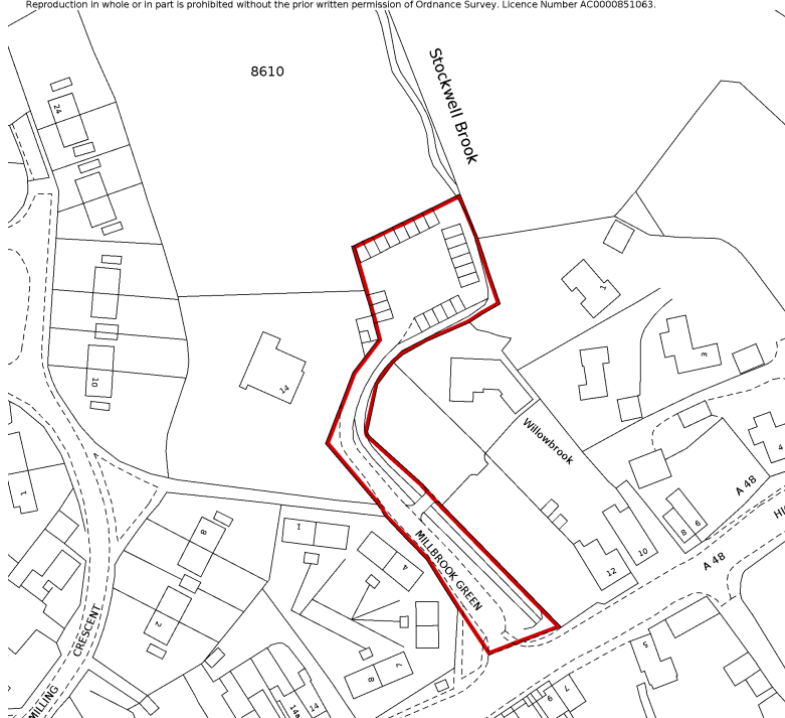
Millbrook Green Garages & Brook

© Crown Copyright. Produced by HM Land Registry. Reproduction in whole or in part is prohibited without the prior written permission of Ordnance Survey. Licence Number AC0000851063.